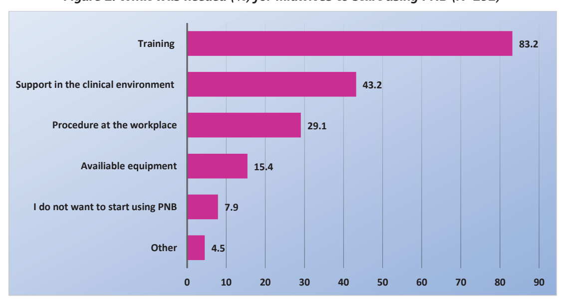
Figure 2. What was needed (%) for midwives to start using PNB (N=292)

phase [67% (157/235)], an early urge to push [60% (142/235)] and if, for various reasons, epidural analgesia was not possible [57% (134/235)], while 49% (115/235) used PNB in connection with suturing (data not shown in tables or figures). Over 85% of midwives who used PNB were largely satisfied or very satisfied with the effect, regardless of whether they used it during the delivery or for suturing. By contrast, <2% of midwives who used PNB were largely dissatisfied or very dissatisfied with the effect. Fifty percent of the midwives reported having observed obstetricians providing pudendal nerve block analgesia.